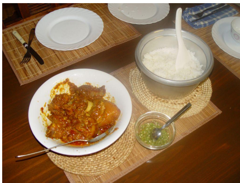
The « carry patté cochon » with rice It is very fatty and a little bit stodgy but very good.